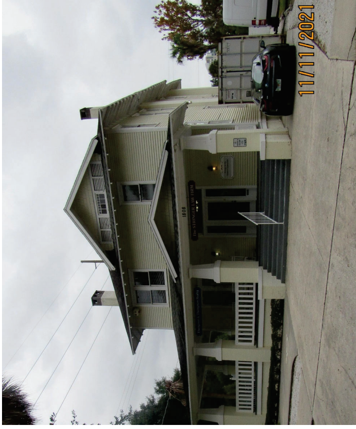
Part 1 Application