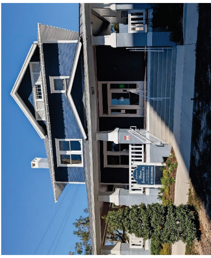
Part 2 Application